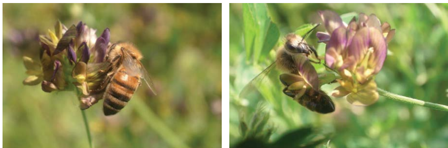
Fig. 4.2. Honeybee ( Apis mellifera ) foraging on lucerne ( Medicago sativa subsp. varia ).

Pollinator decline has been driven in part by habitat loss, reducing the abundance and diversity of floral resources and nesting opportunities (Goulson et al. , 2015). In addition, pollinators have been exposed to cocktails of agrochemicals and other changes in agricultural practices (Goulson et al. , 2015). As a consequence of declines in pollinator abundance and diversity, seed yields can decline, for example, in red clover ( Trifolium pratense ) (Bommarco et al. , 2012). To conserve and promote bees and local pollination services, field margins sown with the legume-based pollen and nectar mixture have been shown to be beneficial in terms of attracting bees (Carvell et al. , 2007; Woodcock et al. , 2014), although legume flowers are not a suitable resource for many non-bee pollinators. Therefore, planting legumes could enhance bee populations in some contexts (Scheper et al. , 2013), aid conservation efforts and simultaneously improve crop yields (Palmer et al. , 2009). Additionally, many legumes provide extra-floral nectar, which is accessible to many invertebrates, including beneficial species such as parasitoid wasps (Géneau et al. , 2012). Not all legumes depend on bee-mediated pollination or