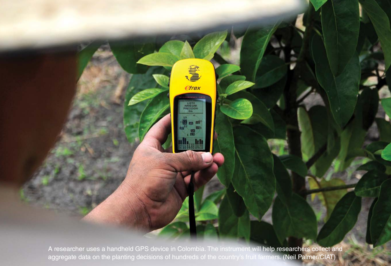
A researcher uses a handheld GPS device in Colombia. The instrument will help researchers collect and aggregate data on the planting decisions of hundreds of the country's fruit farmers.